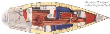
The Sabre 425 is offered without the forward head.