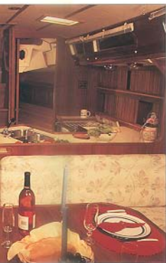
The Sabre 425's large walk-in galley makes meal preparation a breeze, even in a seaway. There's a generous amount of workspace, including a section of countertop that slides away behind the range when not in use.

Sailing from the Sabre 425's T-shaped cockpit is truly a pleasure. Ergonomically designed for function and comfort, the cockpit has high backrest coamings and plenty of room to spread out. The helmsman's seat is raised, allowing excellent visibility over the 44" destroyer wheel, and two deep lockers and a storage bin keep sail gear well organized.