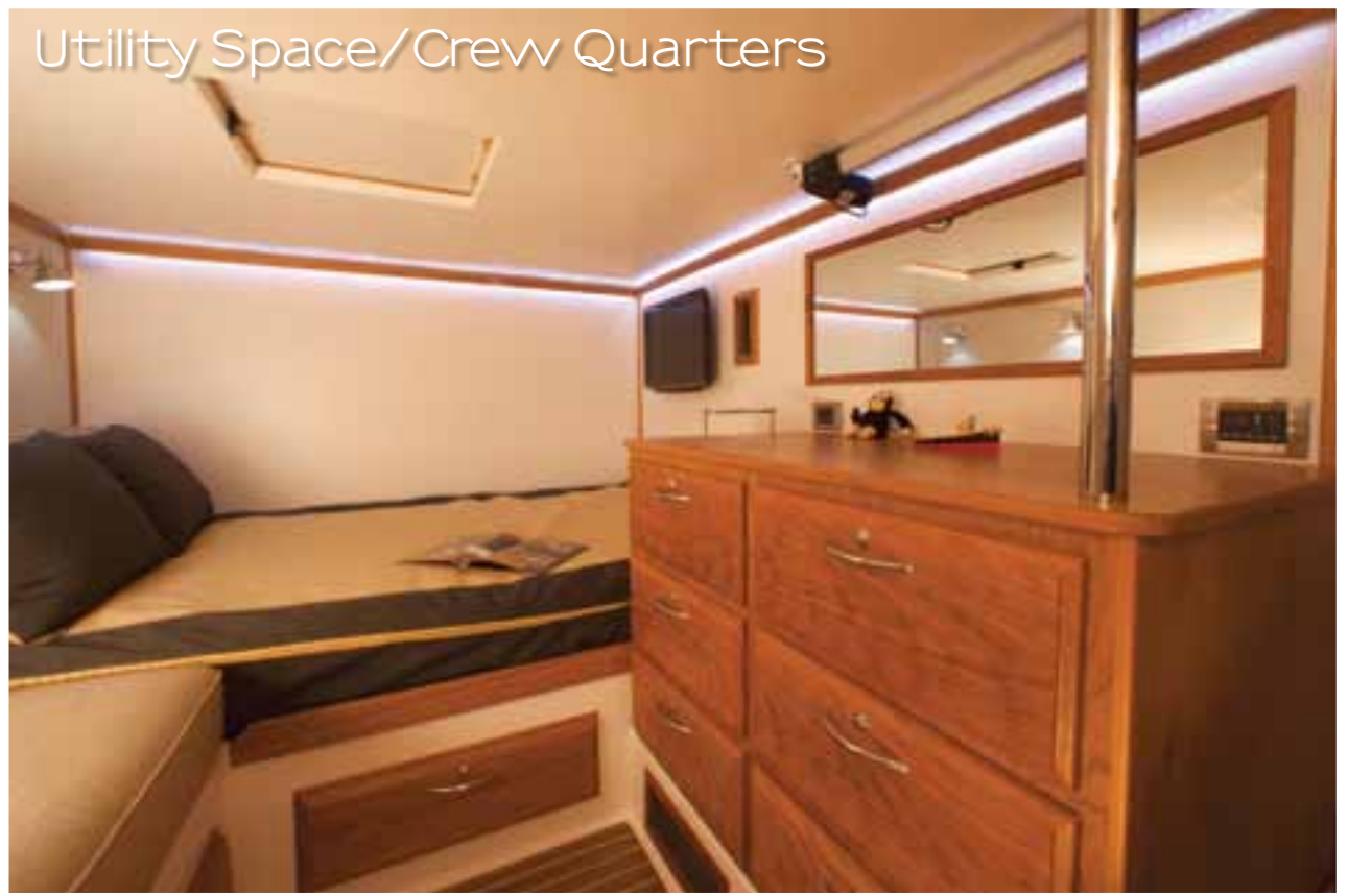
Utility Space/Crew Quarters

Shown here is the crew quarters option with queen sized berth, multiple storage drawers, a wall mount television and a small head compartment.