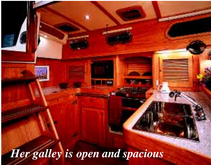
Her galley is open and spacious

A full seven cubic feet of refrigerator space is accessible through two top lids and a front door. The front opening door even has recessed shelves, just like a domestic refrigerator. The microwave oven is powered by a standard 2500 Watt inverter. Dry storage volumes are spacious and we've even made one cupboard big enough for the lobster pot. So, if your plans call for long voyages, then this is a galley that you will enjoy.