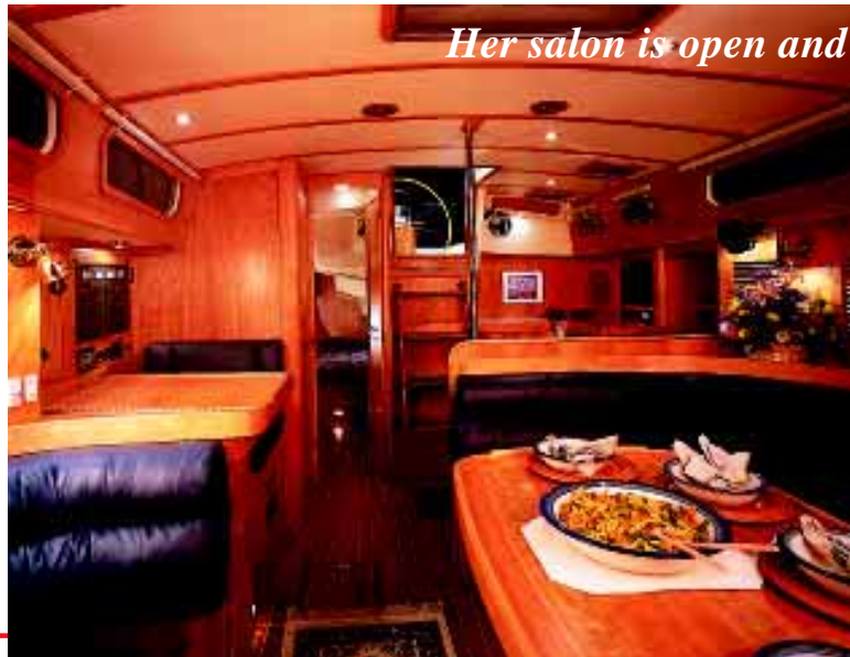
Her salon is open and airy, designed with many hatches and ports to

fill the cabin with light and fresh breezes. The area to port will seat six adults in comfort while the starboard settee offers a clever fold-down table for light meals, a drink or a book. For your convenience and security Sabre provides a switch at the companionway which illuminates the courtesy lights and an overhead light at the chart table. A dimmer has been added to the overhead light circuit to add ambiance to this luxurious space. And behind all of these beautiful furnishings and bright ideas is an abundance of storage space; all you'll need for those long cruises you've been planning.